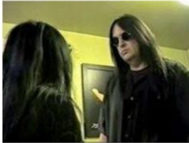
Music Video Screen shot of "Is It True?" based on true events